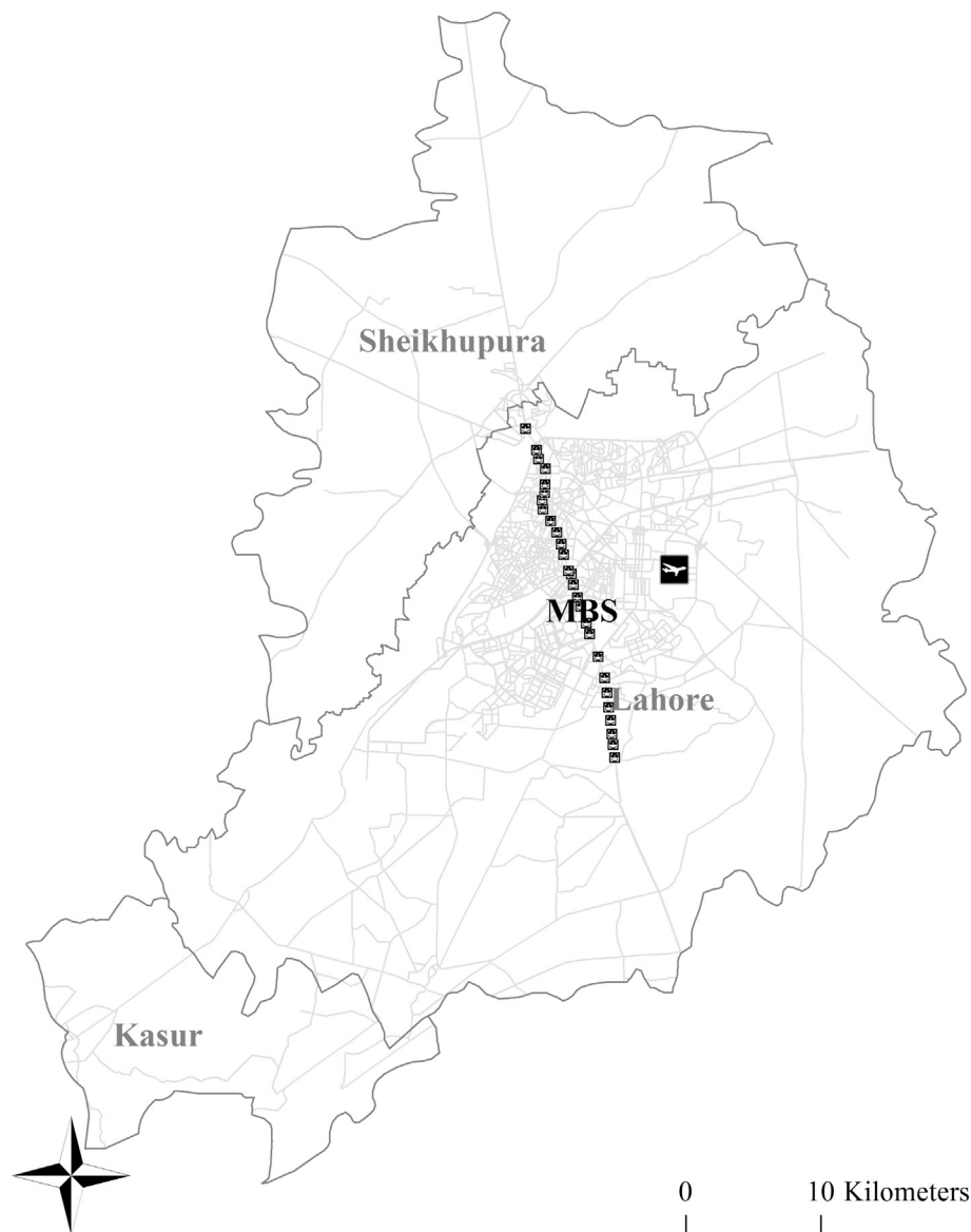
Fig. 2. Service area for the Metro Bus System (MBS) in Lahore.

points, the gold standard is 85 points or above, the silver standard is 70 to 84 points and the bronze standard is 55 to 69 points. If a corridor achieves the minimum criteria for a BRT 2 but scores less than 55 points, then The BRT Standard ranks the BRT corridor as basic. The latter is the designation of the MBS (Ali and Rathore, 2015). The design elements of the MBS corridor inconsistent with operational performance and service quality include access and integration, infrastructure and service planning. On the design element of access and integration, MBS stations are indeed pedestrian accessible via bridges or underpasses. However, MBS stations are not universally accessible and integration between the MBS corridor and the greater public transportation network in Lahore is ongoing. In the former case, MBS stations are not universally accessible to wheelchairs. In the latter case, the first phase of MBS feeder routes was operational in March of 2017 (PMA, 2018). Overcrowding 3 (at